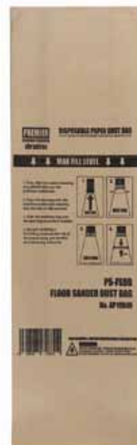
Dust control bags AP10519

DESCRIPTION: Suitable for use on rotary drum sanders, including: Hire Tech HT8 and Clarke EZ8.