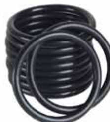
Bag retaining rings AP10519A