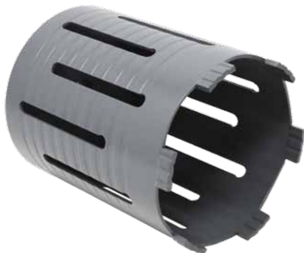
1/2" BSP Female Thread